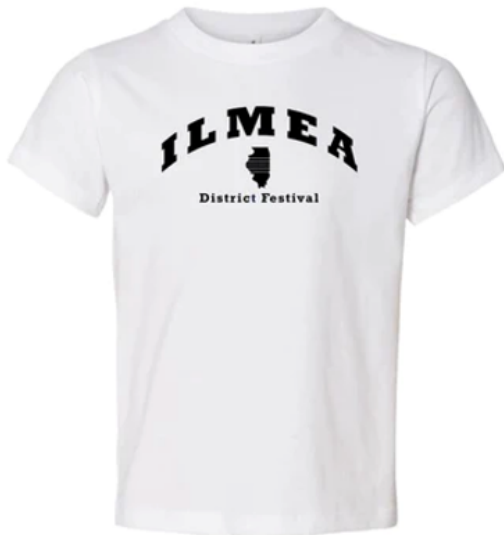
District T-shirt ILMEA Logo on the front $25