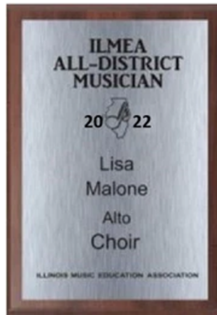
Student Plaque 6x8 $25