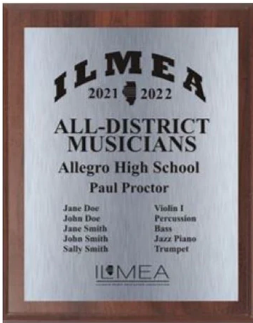
Directors Plaque 8x10 $50