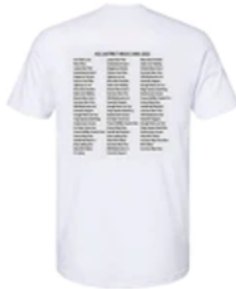
Students names on the back

* 3% will be added to all credit card purchases